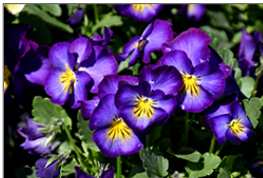
Halo Violet Pansy flowers

Halo Violet Pansy is recommended for the following landscape applications;