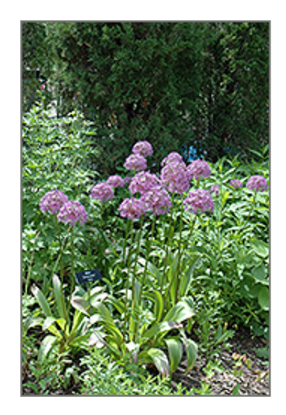
Globemaster Ornamental Onion in bloom