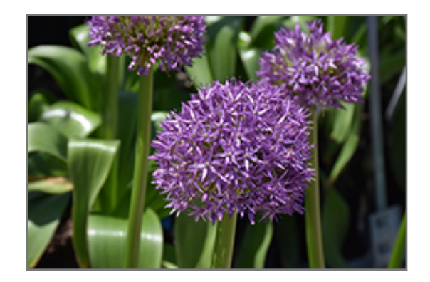
Globemaster Ornamental Onion flowers