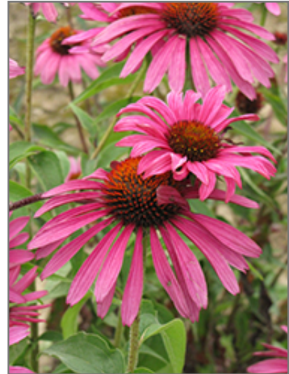
Ruby Star Coneflower flowers