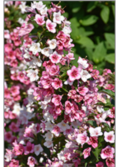
Czechmark Trilogy Weigela flowers