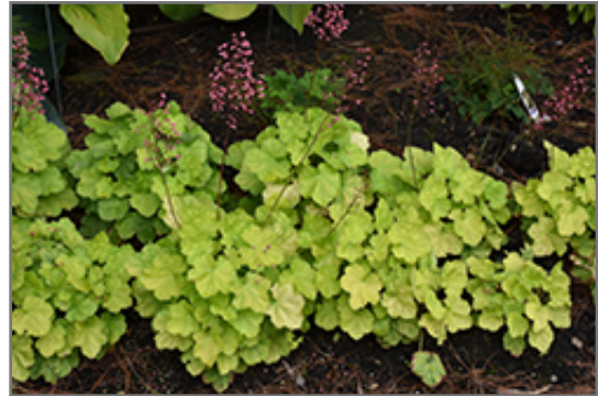
Primo Pretty Pistachio Coral Bells

Primo Pretty Pistachio Coral Bells will grow to be about 10 inches tall at maturity extending to 22 inches tall with the flowers, with a spread of 28 inches. When grown in masses or used as a bedding plant, individual plants should be spaced approximately 26 inches apart. Its foliage tends to remain low and dense right to the ground. It grows at a medium rate, and under ideal conditions can be expected to live for approximately 10 years. As an evergreen perennial, this plant will typically keep its form and foliage year-round.