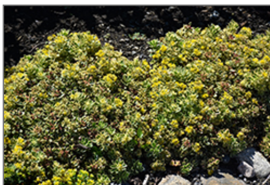
Rock 'N Low Boogie Woogie Stonecrop in bloom