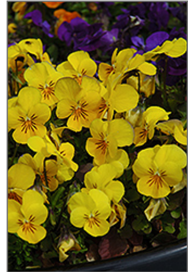
Penny Yellow Pansy flowers

Penny Yellow Pansy is recommended for the following landscape applications;