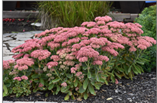
Autumn Fire Stonecrop in bloom