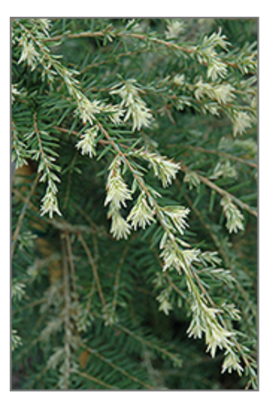
Summer Snow Hemlock foliage

Summer Snow Hemlock is a dwarf conifer which is primarily valued in the landscape or garden for its decidedly oval form. It has attractive dark green evergreen foliage which emerges white in spring. The needles are highly ornamental and remain dark green throughout the winter.