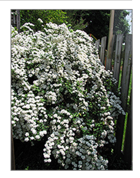
Vanhoutte Spirea in bloom