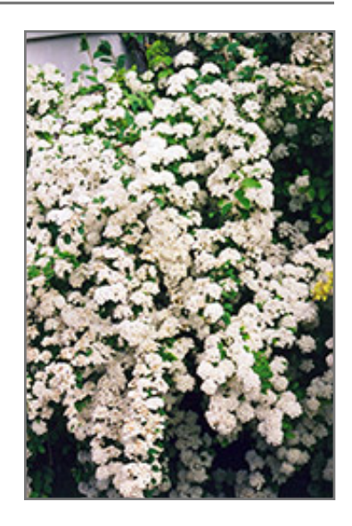
Vanhoutte Spirea flowers

* This is a 'special order' plant - contact store for details