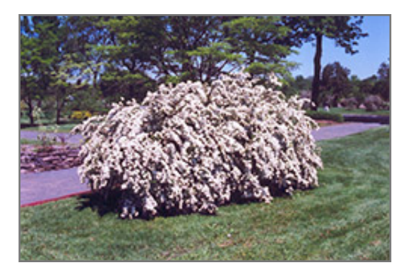
Vanhoutte Spirea in bloom