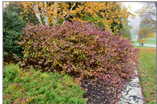
Bailey Red-Twig Dogwood in fall