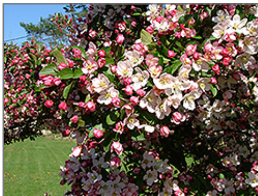
Guinevere Flowering Crab flowers