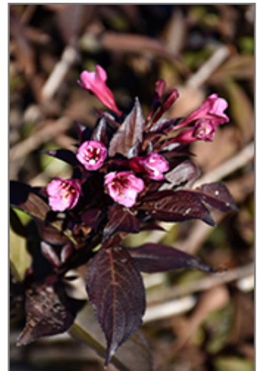
Fine Wine Weigela flowers