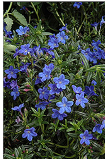
Grace Ward Lithodora flowers