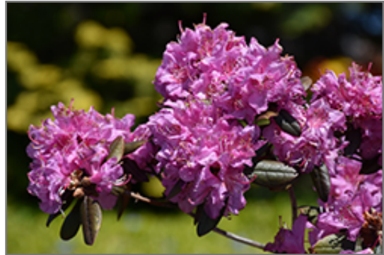
Midnight Ruby Rhododendron flowers

Midnight Ruby Rhododendron will grow to be about 3 feet tall at maturity, with a spread of 3 feet. It tends to be a little leggy, with a typical clearance of 1 foot from the ground. It grows at a slow rate, and under ideal conditions can be expected to live for 40 years or more.