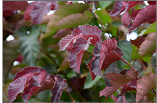
Purpleleaf Bailey Select American Hazelnut foliage

Aside from its primary use as an edible, Purpleleaf Bailey Select American Hazelnut is suitable for the following landscape applications;