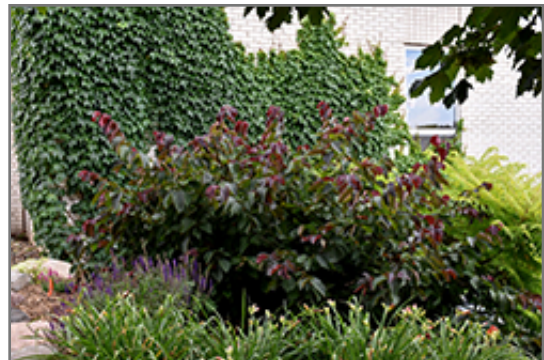
Purpleleaf Bailey Select American Hazelnut