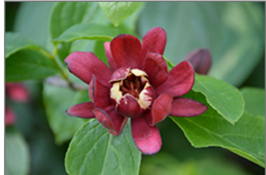
Simply Scentsational Sweetshrub flowers