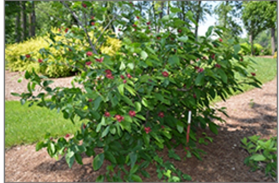
Simply Scentsational Sweetshrub in bloom

This shrub does best in full sun to partial shade. It is very adaptable to both dry and moist locations, and should do just fine under average home landscape conditions. It is not particular as to soil type or pH. It is somewhat tolerant of urban pollution. This is a selection of a native North American species.