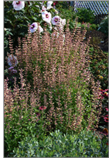
Meant To Bee Queen Nectarine Anise Hyssop in bloom

Meant To Bee Queen Nectarine Anise Hyssop is a fine choice for the garden, but it is also a good selection for planting in outdoor pots and containers. With its upright habit of growth, it is best suited for use as a 'thriller' in the 'spiller-thriller-filler' container combination; plant it near the center of the pot, surrounded by smaller plants and those that spill over the edges. It is even sizeable enough that it can be grown alone in a suitable container. Note that when growing plants in outdoor containers and baskets, they may require more frequent waterings than they would in the yard or garden.